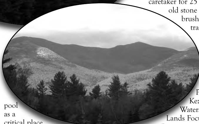
pool as a critical place of scenic beauty.

Rattlesnake flume (a gorge that is 300 feet long and 20 feet wide) and Rattlesnake pool (a natural swimming hole that is 20 feet deep) are easily accessible on the property via the Stone House Trail. These features are destinations for many hikers, including those with young children. The State of Maine designated Rattlesnake